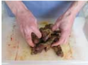
(Goose Meat Shown)