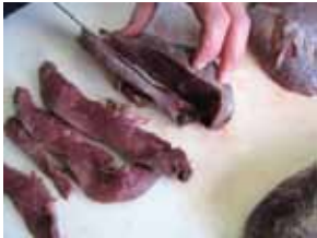
(Goose Meat Shown)