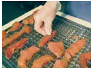
(Turkey Meat Shown)